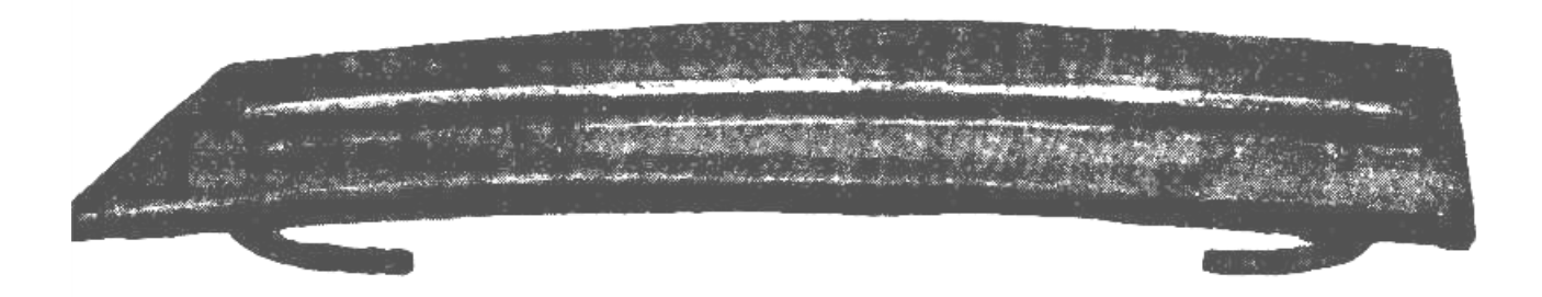
Fig. 2. A forming lining with a ledge

After welding the sample cut on some parts, subjected to various heat treatment, and investigated. The actual chemical compound of initial materials and seam metal is presented to tab. 1, and macrosection of welded connection (Fig. 3).