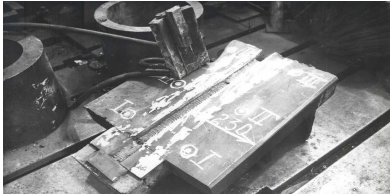
Fig. 1. The sample welded from a two-layer steel and forming slide-block with a ledge, preventing hashing of a plating layer with the basic metal